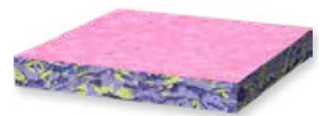
Surface Treated Polymer Reinforced Web

Polybond RST 80 gsm is a unique Surface Treated Reinforced top web solution made of a 80 gsm fiber matrix saturated with a selection of water based, synthetic and soft resins to dramatically enhance its mechanical behavior of the material. The chemical treatment added to the reinforced matrix allows excellent sealing performance, high reactivity, while persuing optimized breathability for efficient EO sterilization process. With a renewable resources content of more than 70% for better environmental performance, Polybond RST 80 gsm is designed to seal to flexible formable film grades such as PA/PE or PP/PA/PE or PP/PE substrates. Polybond RST 80 gsm is compatible with EO and Irradiation sterilization processes.